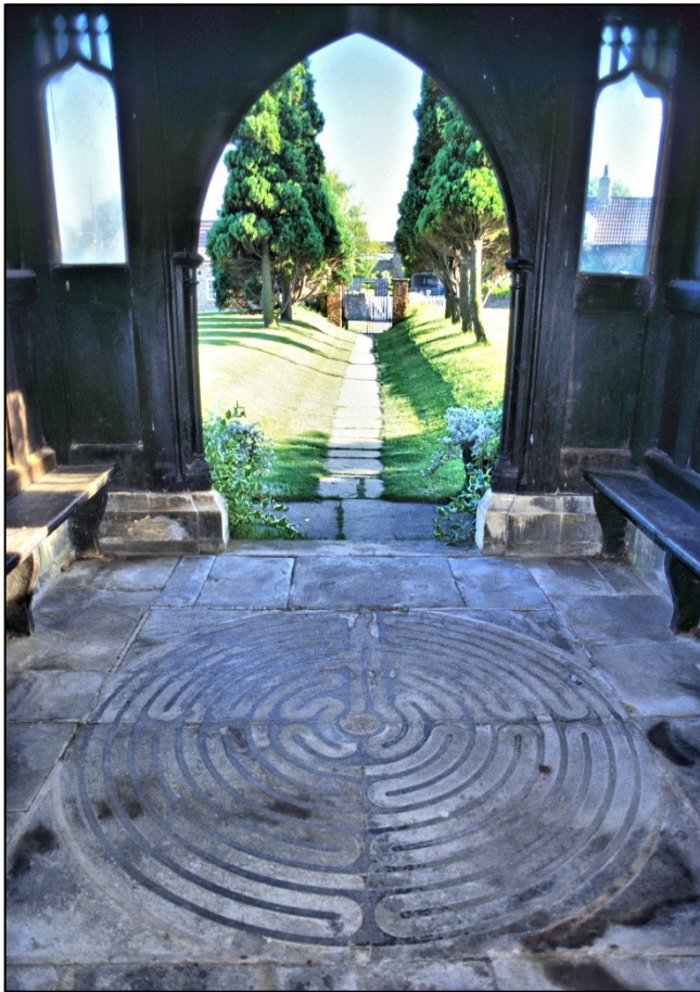
The porch and stained glass window Alkborough Church